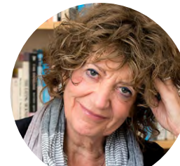
Dr Susie Orbach