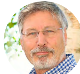
Dr Bessel van der Kolk